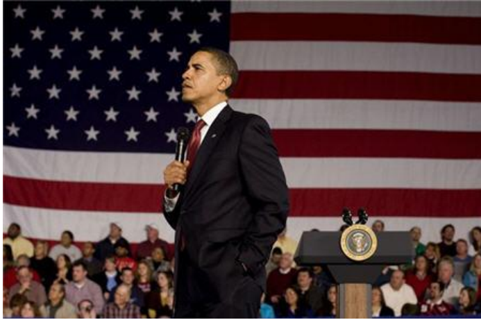
Pres. Obama at a town hall meeting in Belgrade, Montana on Aug. 14, 2009 to discuss health care reform.

Who would fund the reforms? Would there really be “death panels”? Sorting out the possibilities, facts, and misconceptions.